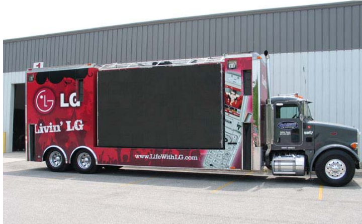
Figure 5. An Example of a Tractor-Trailer Equipped with an LED Screen to Display Digital and Video Advertising in Traffic or While Stopped