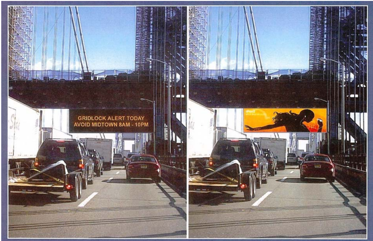
Figure 3 - Artist's Rendering of Proposed Official CMS Within the Roadway Right-of-Way that Would Also Display Advertising