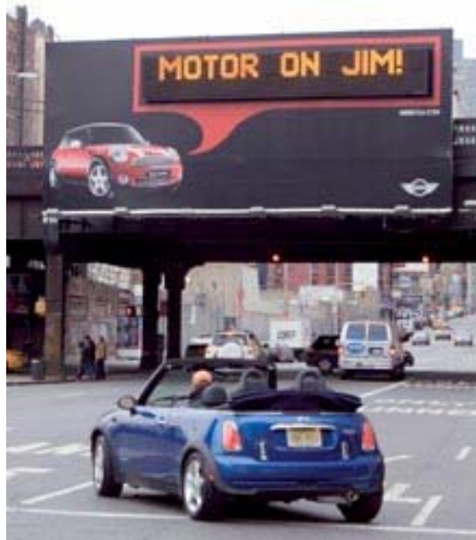
Figure 4 - A billboard for the Mini automobile. A sensor on the sign reads information from the vehicle RFID key and displays a greeting to the owner.